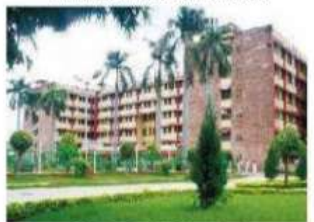
Sir Sunderlal Hospital