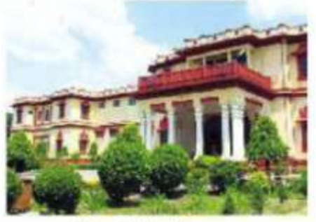
Bharat Kala Bhawan