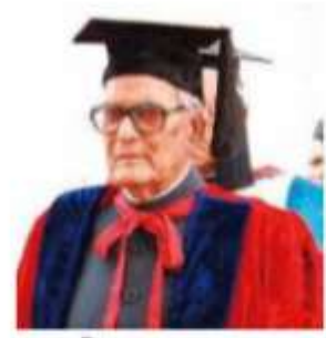
89<sup>m</sup> Convocation – 2007 Hon'ble Vice-President of India Shri Bhairon Singh Shekhawat