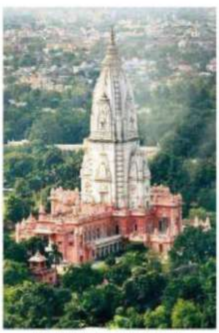
Shri Vishwanath Temple

BHU is the first Central University in India which has implemented a 'Graphic Identity Programme'. Through this programme, BHU has standardized its seal, logo, bilingual logotypes, tagline, colour identity etc. This programme also includes standardization of office stationery and signage system of the campus through its Design Studio, Souvenir shop, Electronic, Web & Social media.