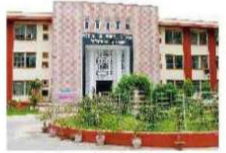
Institute of Medical Sciences