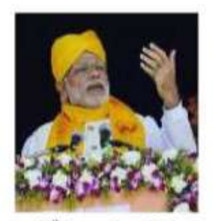
98" Convocation – 2016 Hon'ble Prime Minister of India Shri Narendra Damodar Das Modi