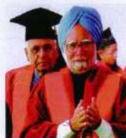
90 th Convocation – 2008 Hon'ble Prime Minister of India Dr. Manmohan Singh