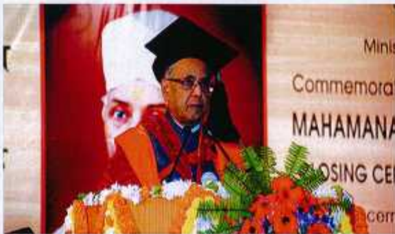
Special Convocation – 2013 to commemorate the 150 th Birth Anniversary of Malaviyaji Hon'ble President of India Shri Pranab Mukherjee