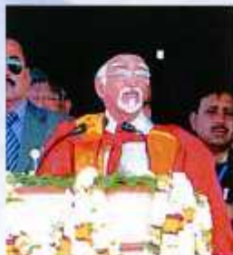
92 nd Convocation – 2010 Hon'ble Vice-President of India Shri Hamid Ansari