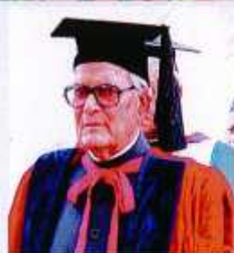
89 th Convocation – 2007 Hon'ble Vice-President of India Shri Bhairon Singh Shekhawat