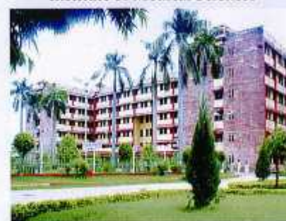
Sir Sunderlal Hospital