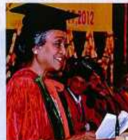
94 th Convocation – 2012 Hon'ble Speaker of Lok Sabha Smt. Meira Kumar