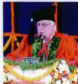
93 rd Convocation – 2011 Hon'ble Minister of HRD Shri Kapil Sibal