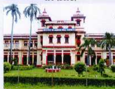
Institute of Agricultural Sciences