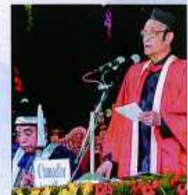
95 th Convocation – 2013 Hon'ble Chancellor of BHU Dr. Karan Singh