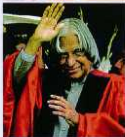
88 th Convocation – 2006 Hon'ble President of India Dr. APJ Abdul Kalam