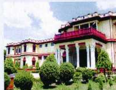
Bharat Kala Bhawan