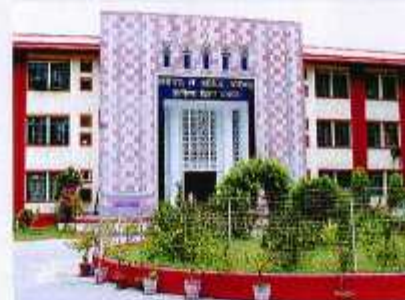
Institute of Medical Sciences