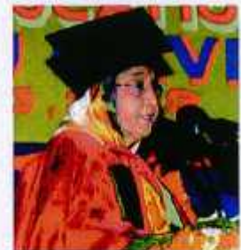
91 th Convocation – 2009 Hon'ble President of India Smt. Pratibha Devi Singh Patil